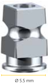
93192 Impression coping squared for Vistafix VXA300 Weight: 0.75 g

NOTE: This figure shows a cross-section of the cover screw conical placed on a VXI300 implant. The distance from bone level (under flange) to the top of the cover screw conical is 1.5 mm.