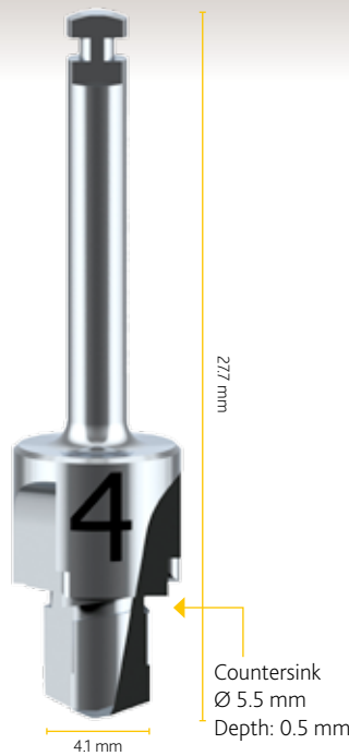
92141 Widening drill 4 mm with countersink Weight: 1.8 g