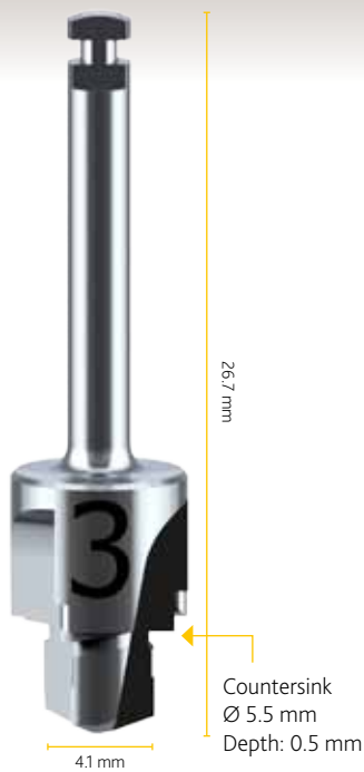
92140 Widening drill 3 mm with countersink Weight: 1.7 g