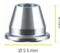
93184 Gold cylinder 4 mm for Vistafix VXA300 Abutment Weight: 0.45 g

Manufacturer: Cochlear Bone Anchored Solutions AB Konstruktionsvägen 14, SE - 435 33 Mölnlycke, Sweden Tel: 46 31 792 44 00 Fax: 46 41 792 46 95