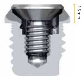
93102 Cover screw conical for Vistafix VXI300 Implant Weight: 0.04 g

NOTE: This figure shows a cross-section of the cover screw conical placed on a VXI300 implant. The distance from bone level (under flange) to the top of the cover screw conical is 1.5 mm.