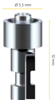
93185 Abutment replica for Vistafix VXA300 Weight: 1 g