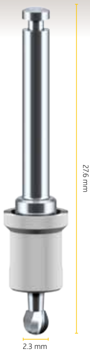
92139 Guide drill 3+4 mm Ø 2.3 mm Weight: 1.1 g